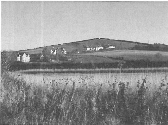
View to access site from B6461