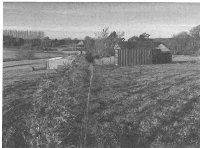
Boundary planting to southern edge (Leylandii Conifers)