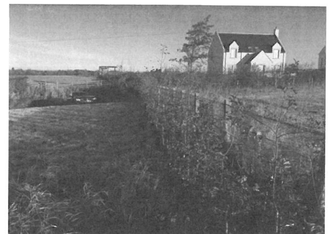
Boundary planting to eastern edge (Crataegus Monogyna - Hawthorn; Corylus Avellana - Common hazel)